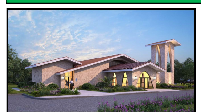
ST. CECILIA ELEVATOR PROJECT GLEN CARBON, ILLINOIS